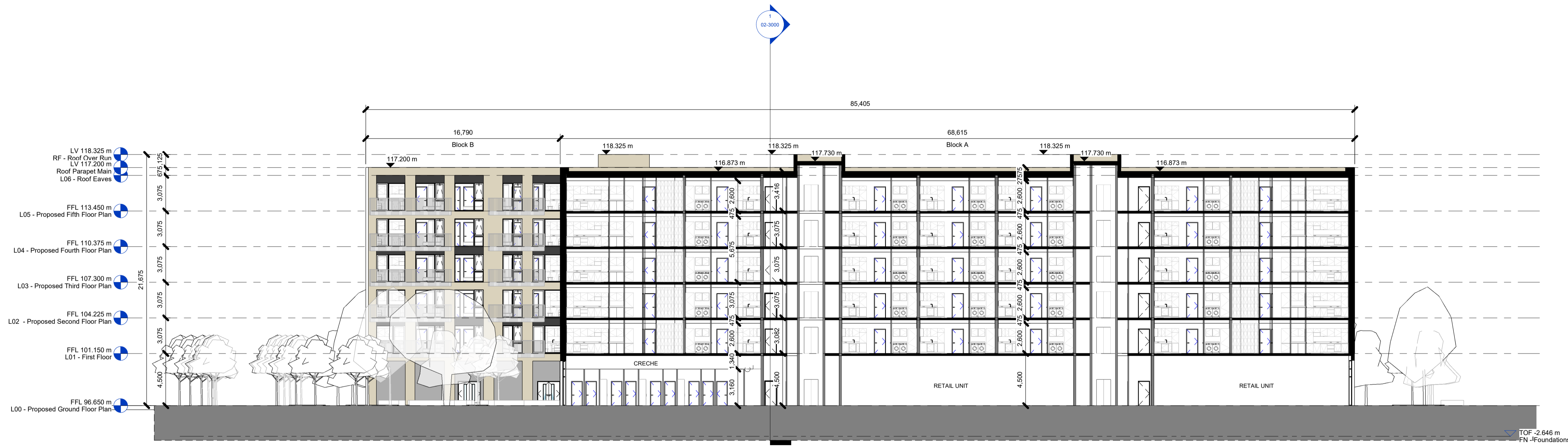
GA Section CC 1 : 200

Notes: - Do not scale from this drawing. Use figured dimensions in all cases. - Verify dimensions on site and report any discrepancies to the Architect immediately. - This drawing is to be read in conjunction with the Architect's Specification. - © This drawing is copyright and may only be reproduced with the Architect's permission.