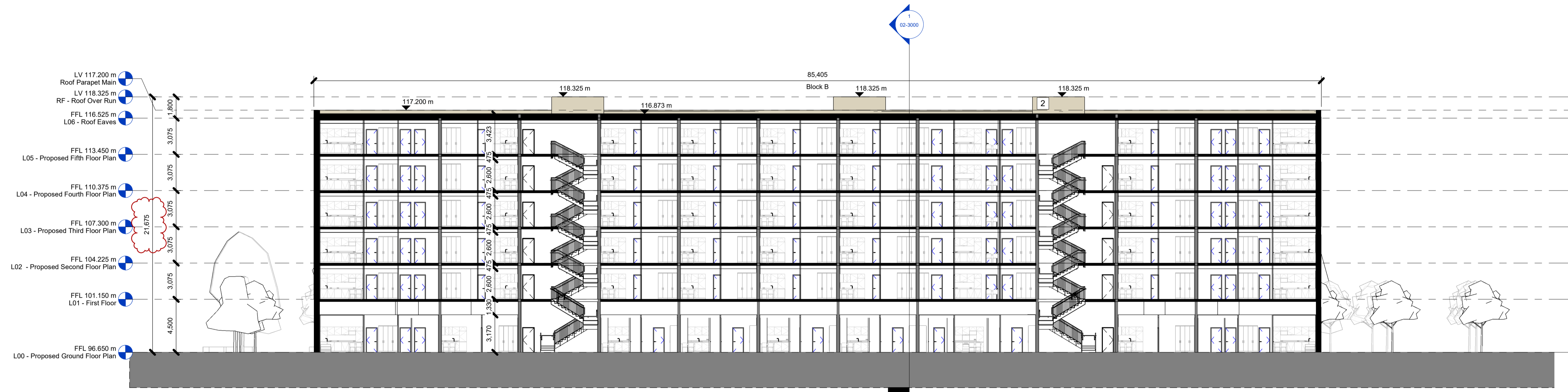
GA Section BB 1 : 200

Notes: - Do not scale from this drawing. Use figured dimensions in all cases. - Verify dimensions on site and report any discrepancies to the Architect immediately. - This drawing is to be read in conjunction with the Architect's Specification. - © This drawing is copyright and may only be reproduced with the Architect's permission.