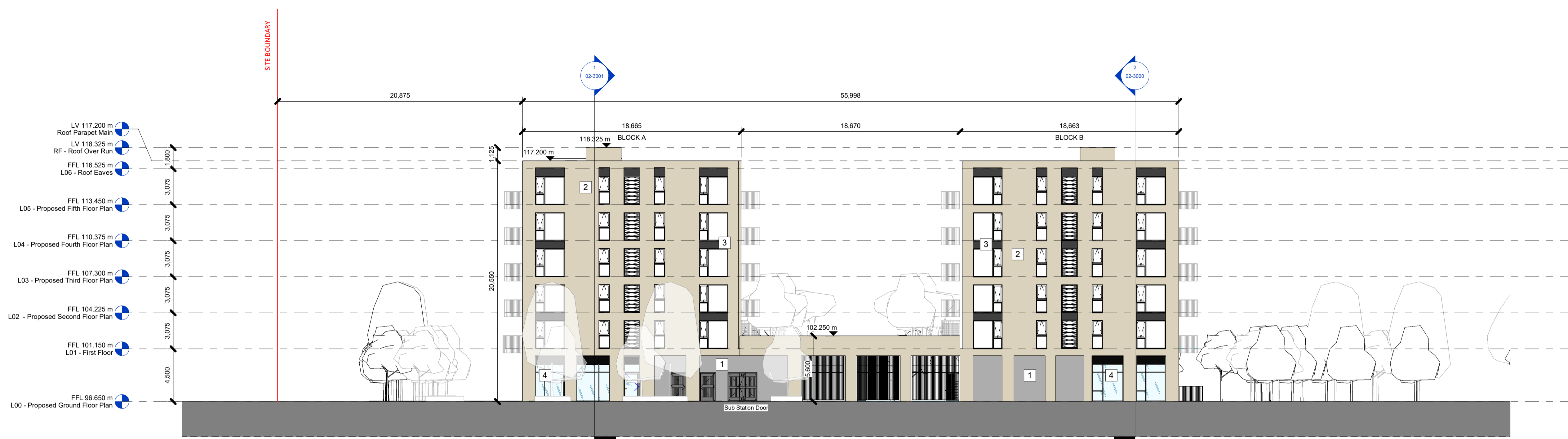
Elevation 3 - Block A & B North 1 : 200