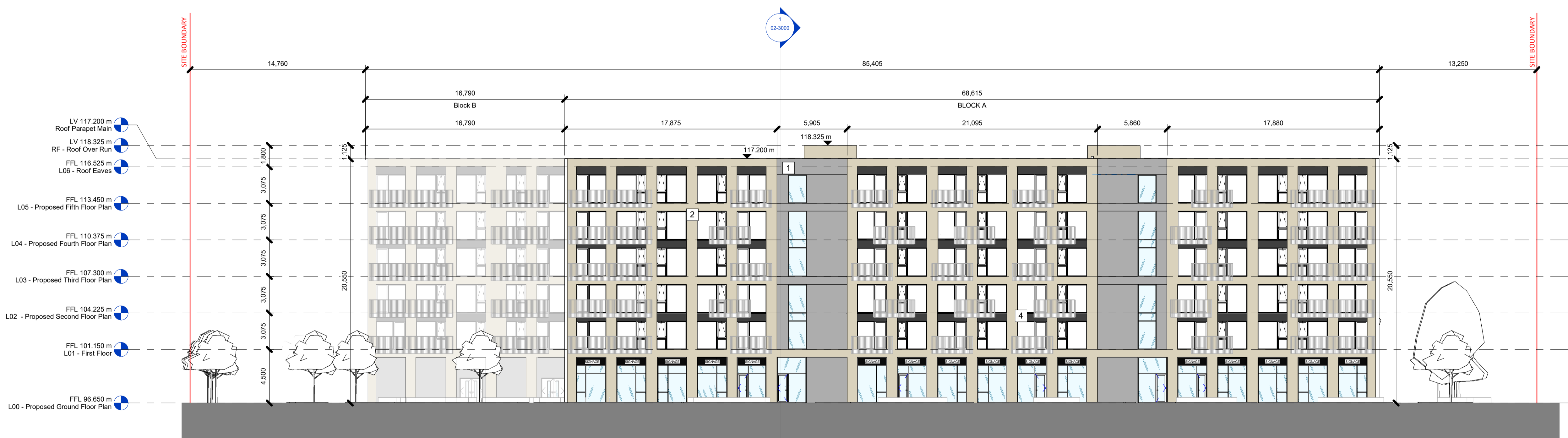
Elevation 4 - Block A East 1 : 200

Notes: - Do not scale from this drawing. Use figured dimensions in all cases. - Verify dimensions on site and report any discrepancies to the Architect immediately. - This drawing is to be read in conjunction with the Architect's Specification. - © This drawing is copyright and may only be reproduced with the Architect's permission.