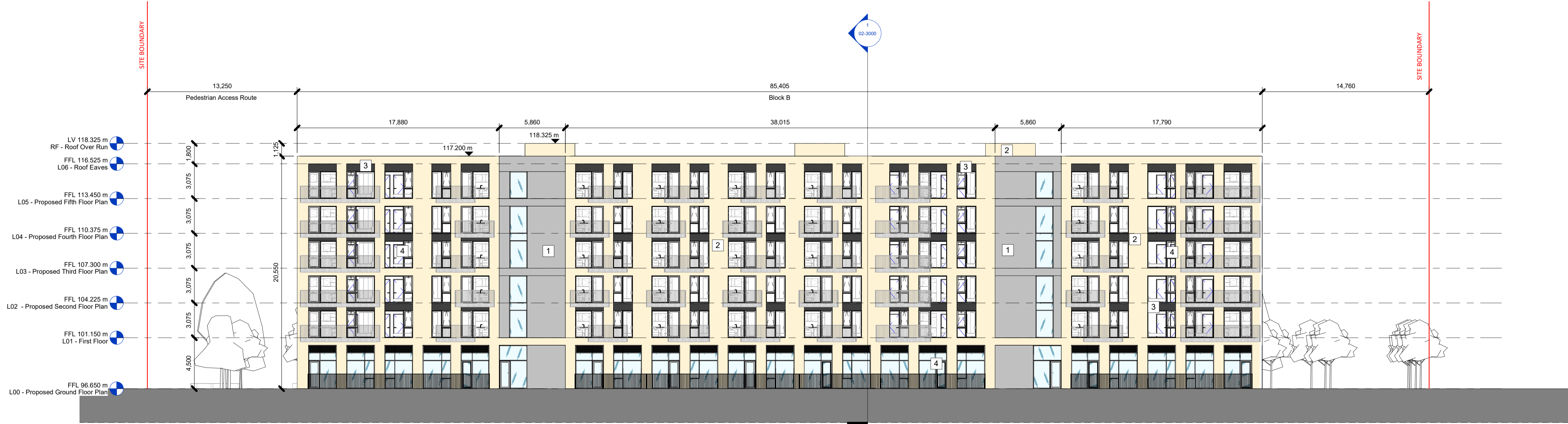
Elevation 2 - Block B West 1 : 200

Notes: - Do not scale from this drawing. Use figured dimensions in all cases. - Verify dimensions on site and report any discrepancies to the Architect immediately. - This drawing is to be read in conjunction with the Architect's Specification. - © This drawing is copyright and may only be reproduced with the Architect's permission.