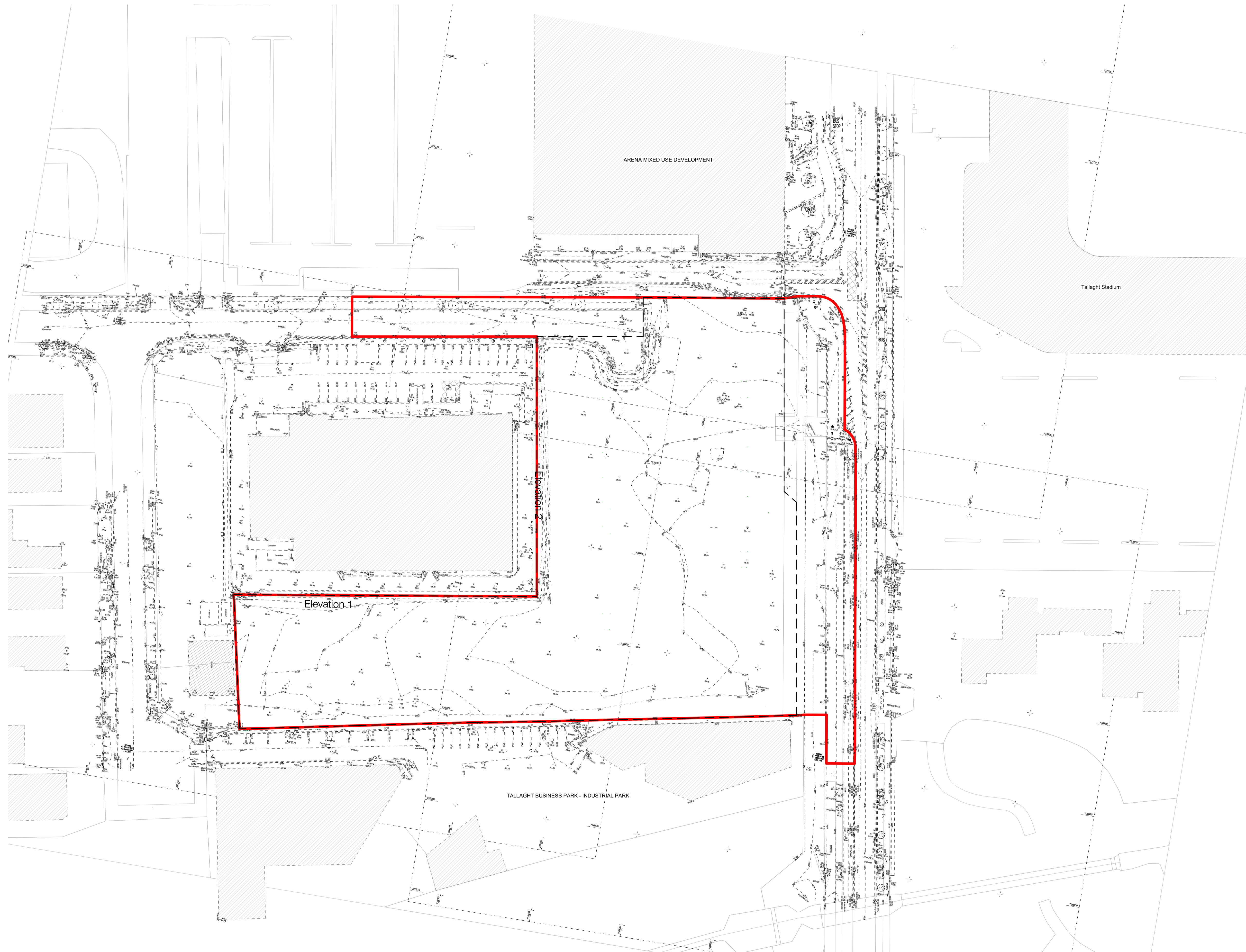
Existing Site Plan 1 : 500

Notes: - Do not scale from this drawing. Use figured dimensions in all cases. - Verify dimensions on site and report any discrepancies to the Architect immediately. - This drawing is to be read in conjunction with the Architect's Specification. - © This drawing is copyright and may only be reproduced with the Architect's permission.